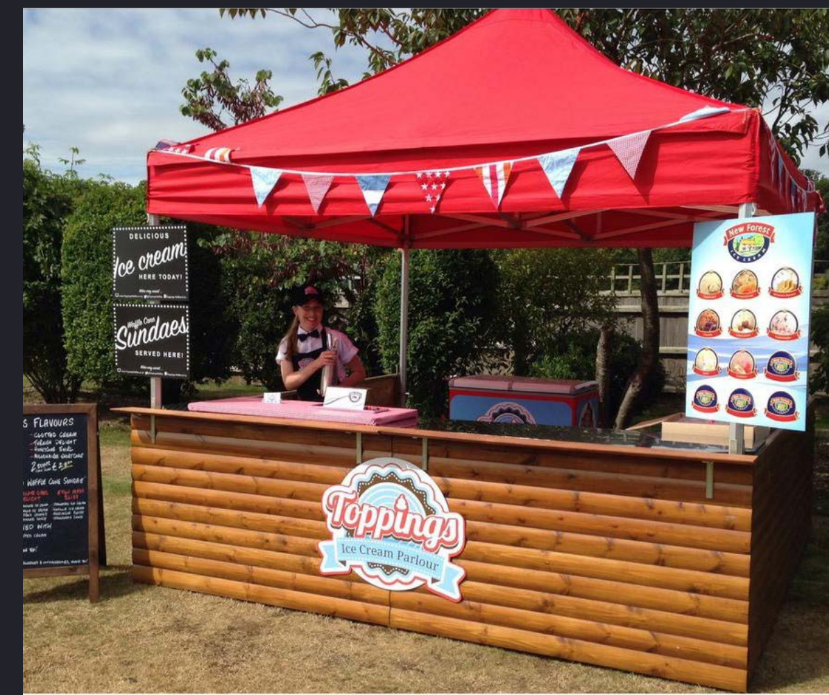
POP UP GAZEBOS