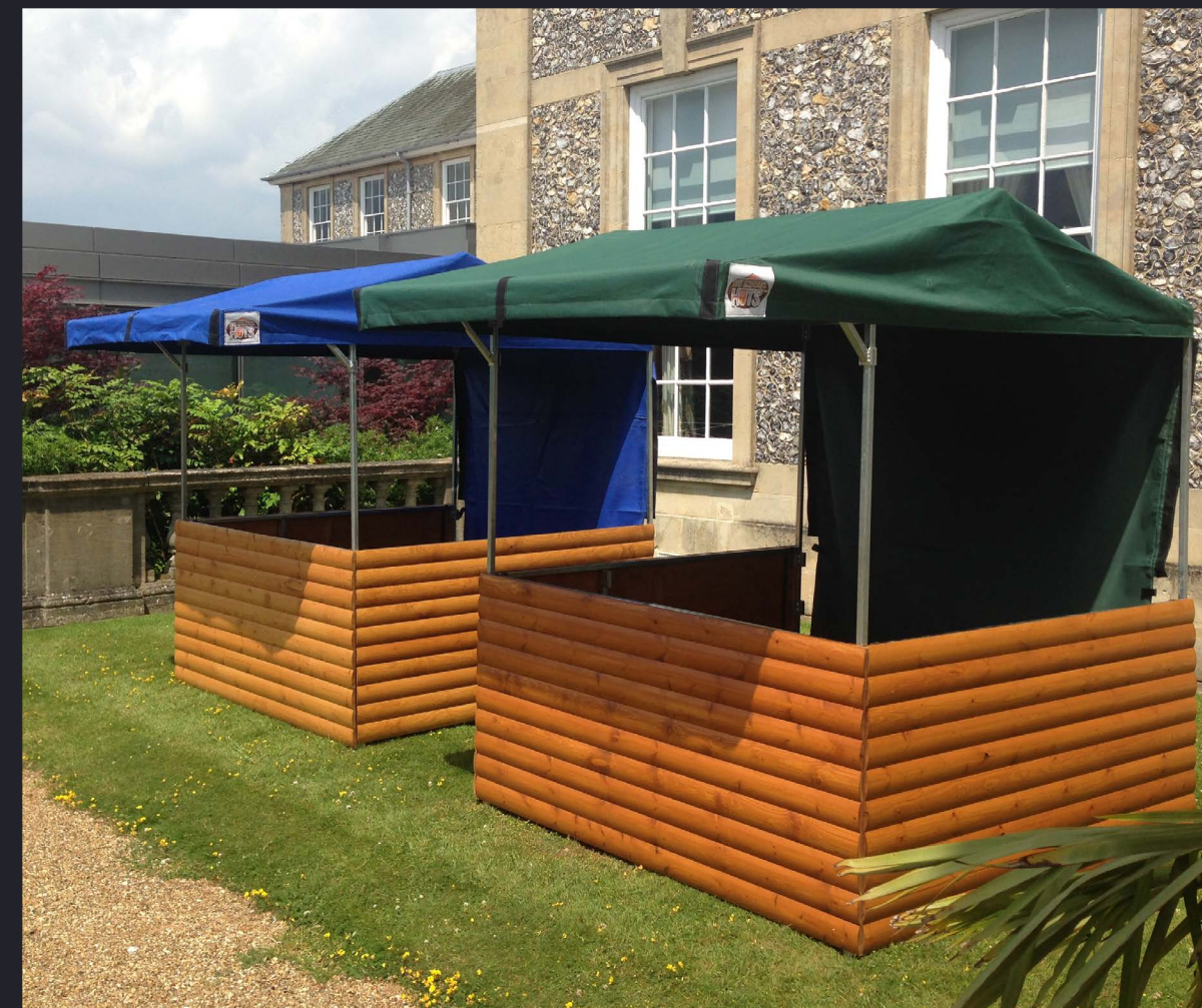
BIG KAHUNA HUTS